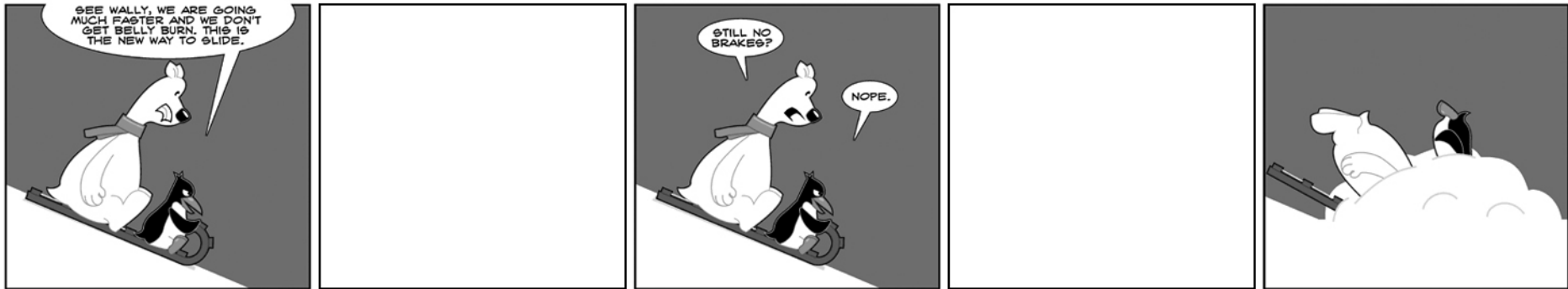
On The Rocks

Create new panels for the blanks in this comic strip. Give your new comic strip a title.